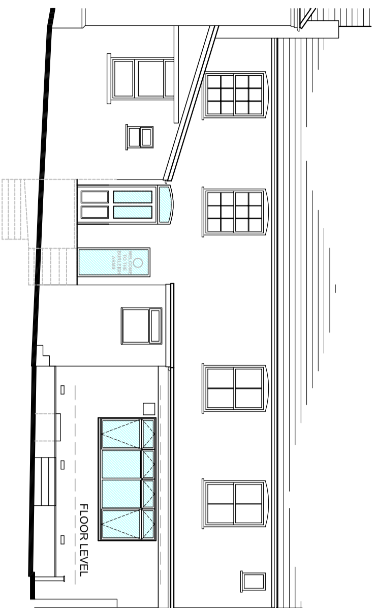
Proposed Rear Elevation Scale 1:100